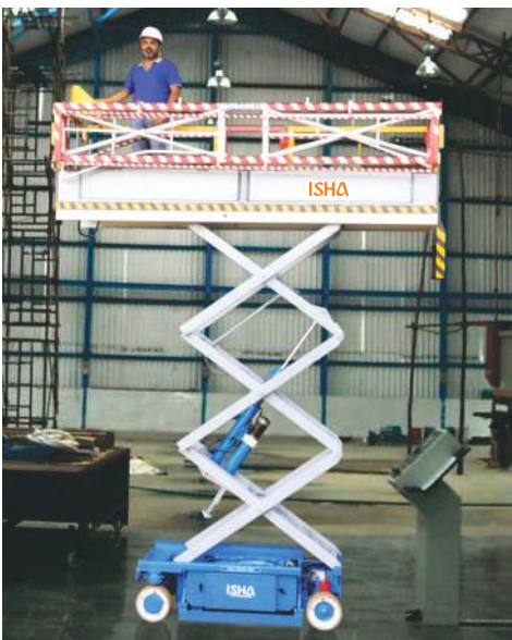
BATTERY OPERATED SCISSOR LIFT