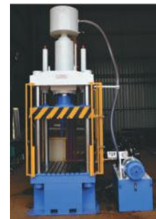
TRIMMING PRESS 200TON