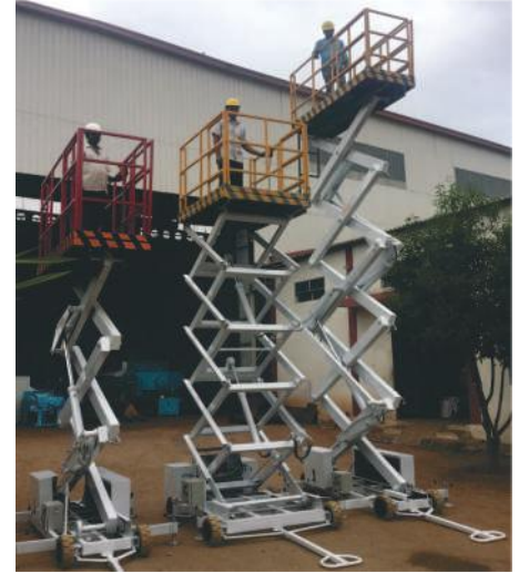
NARROW SCISSOR LIFT