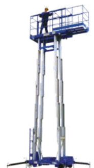
DOUBLE MAST AERIAL WORK PLATFORM