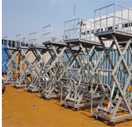
SCISSOR LIFT WITH GALVANIZED COATED