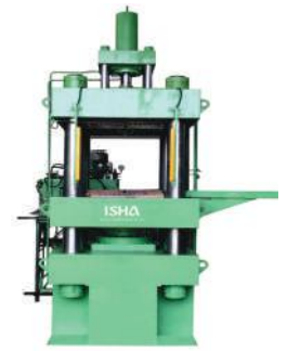
1000 TON RUBBER TRANSFER MOULDING PRESS