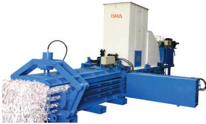
HORIZONTAL BALER FULLY AUTOMATIC