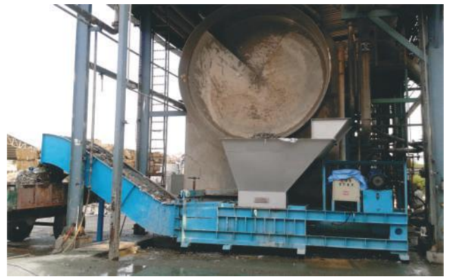
COMPACTOR FOR WASTE PULP