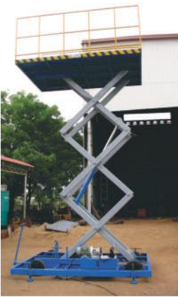
LIGHT DUTY SCISSOR LIFT