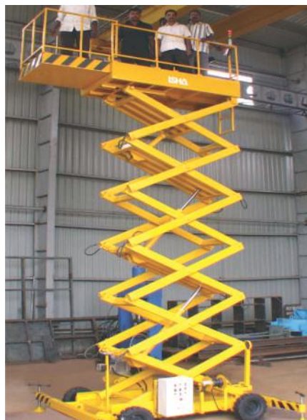
SCISSOR LIFT WITH TOWABLE