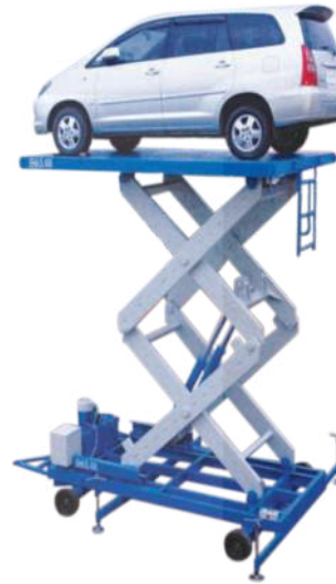
MOVABLE CAR LIFT