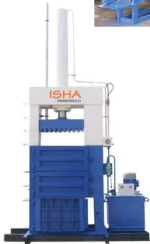
VERTICAL BALER SEMI AUTOMATIC