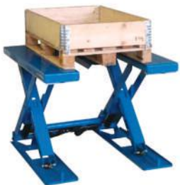
E-TYPE SCISSOR LIFT