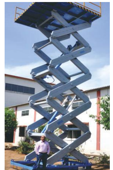
HEAVY DUTY SCISSOR LIFT