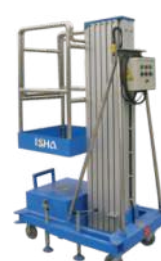
SINGLE MAST AERIAL WORK PLATFORM