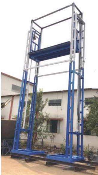
FOUR POST GOODS LIFT