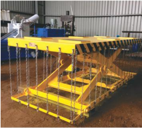
SCISSOR LIFT FOR ENGINE ASSEMBLY