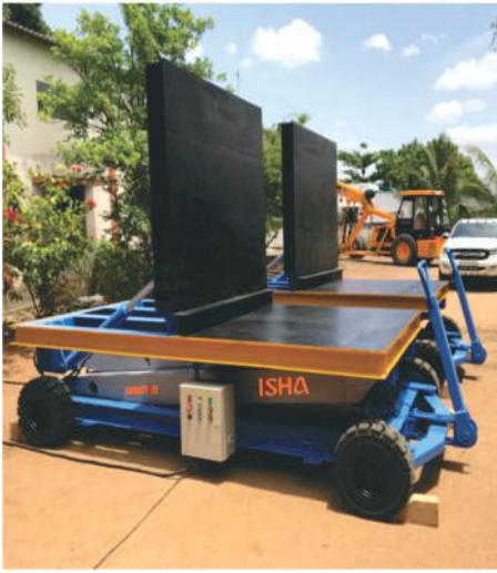
SCISSOR LIFT WITH TILTING PLATFORM