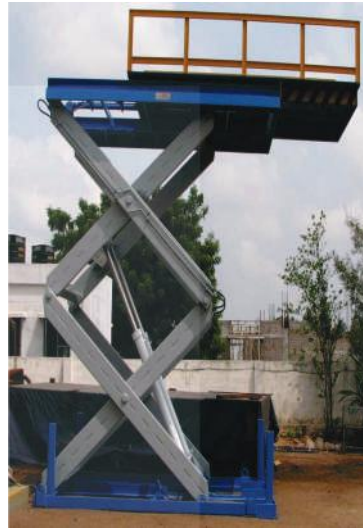
SCISSOR LIFT WITH EXTENSION PLATFORM