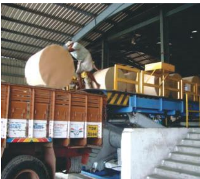
SCISSOR LIFT FOR PAPER REEL LOADING