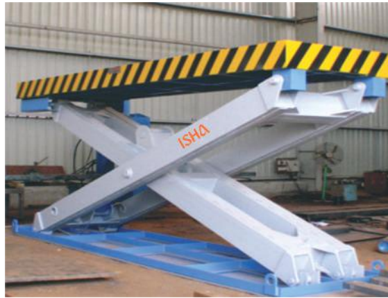
HEAVY DUTY SCISSOR LIFT