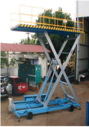
MOVABLE SCISSOR LIFT