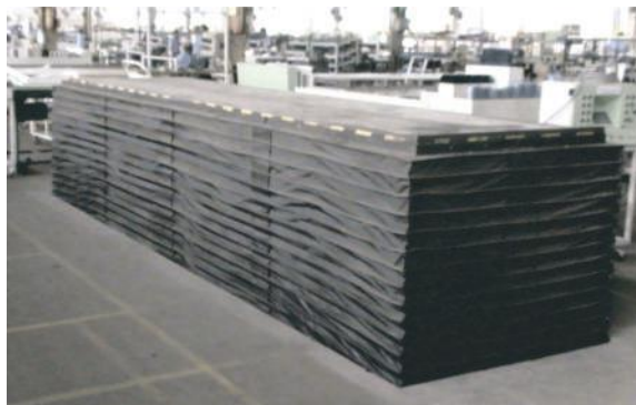
ASSEMBLY SCISSOR LIFTABLE UP TO 50 TON