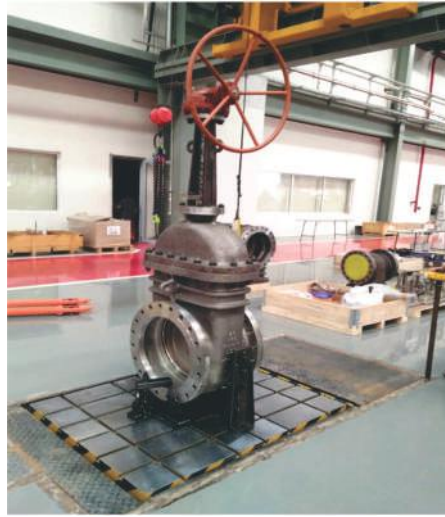
SCISSOR LIFT FOR VALVE ASSEMBLY