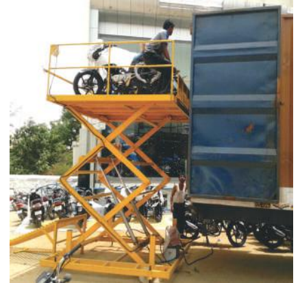
SCISSOR LIFT FOR TWO-WHEELER UNLOADING